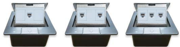
UL-2011A UL-2012A UL-2013A

Body : Galvanized Steel Gasket : IP44 Square Box : Stainless 100 x 100 x 62.1 mm with 1/2" & 3/4" Knockout (included) Compatibility : RJ11 Modular Jack